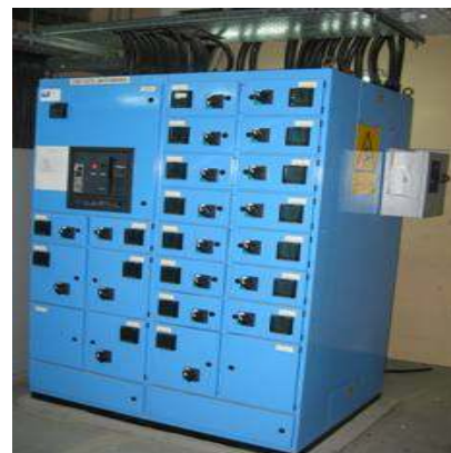
Electrical System Quality Audits